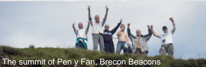
The summit of Pen y Fan, Brecon Beacons

Every resident is assigned a keyworker within a week, who will provide advocacy and support as needed, assisting the resident in positive moves towards independence and greater stability. Clients access the resettlement service via their keyworker.